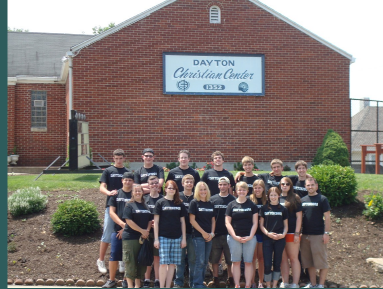
Miamisburg Christian Church